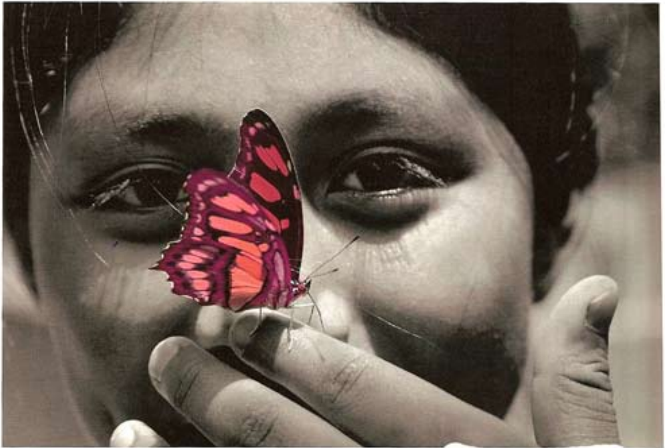
"Nosey" Digital image transformed and hand colored. 6.471 x 10

Katherine Morgan "Turquoise and gold" Digitally transformed and color enhanced cherry blossom. 6.667 x 10. below